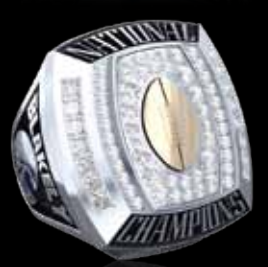
National Champions Design 4XXF